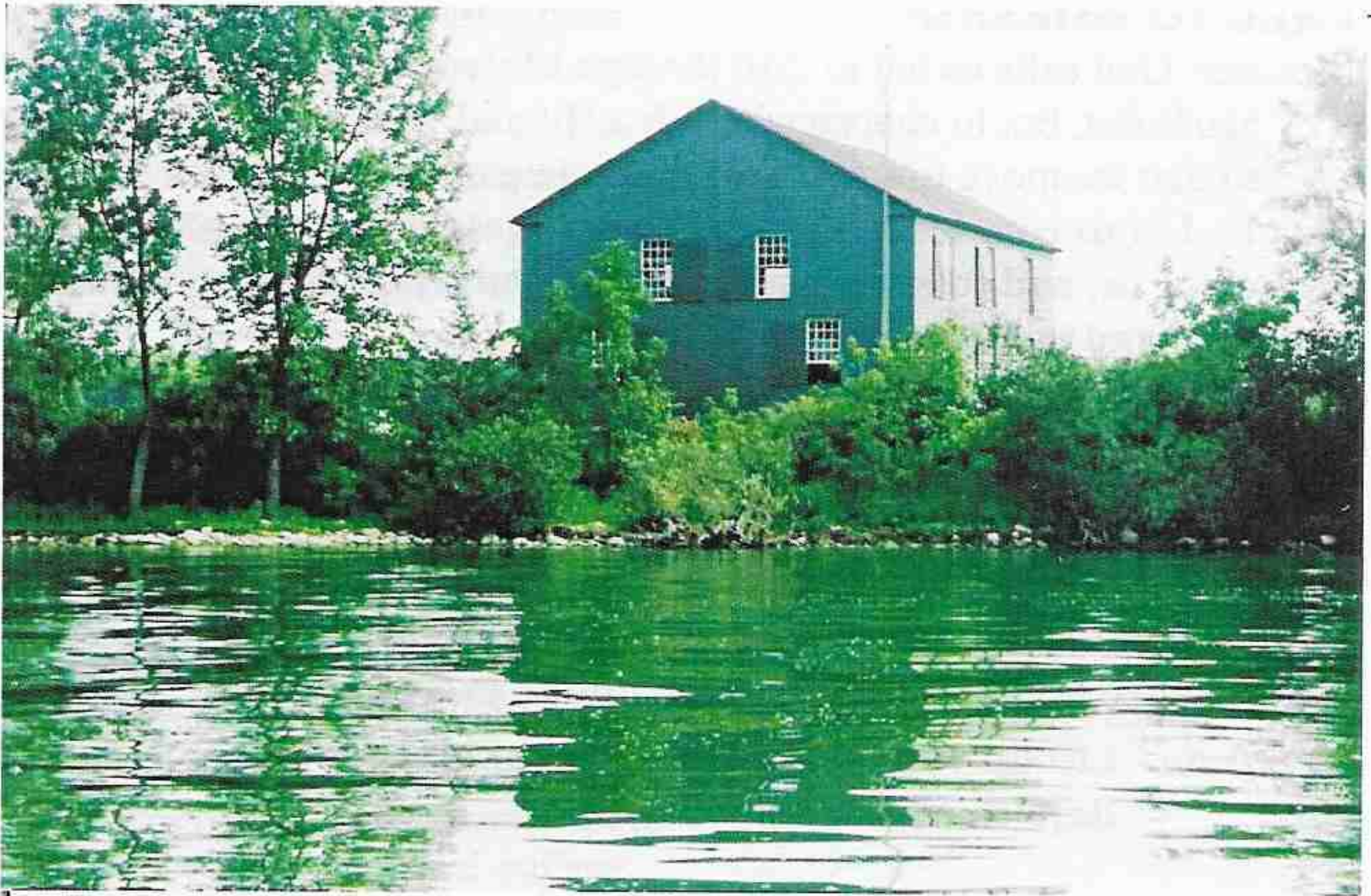
The Church as viewed from Hay Bay